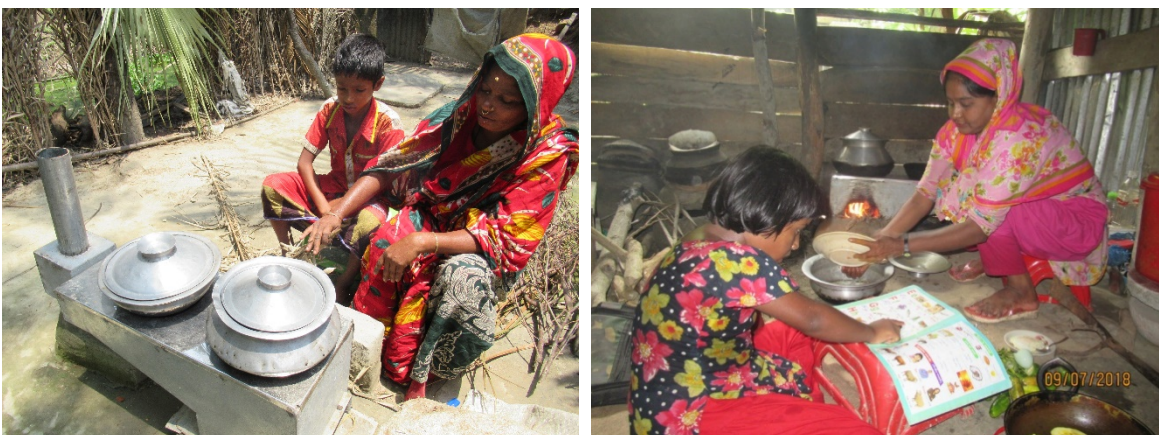
Figure 1: Banglar Unan-CCDB Improved Cookstove (Outdoor and Indoor use)