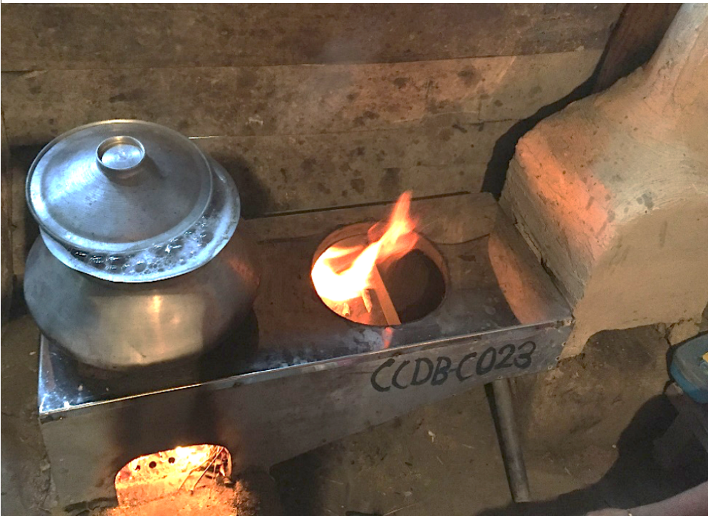
Figure 3: The Banglar Unan (indoor use, connected to chimney)